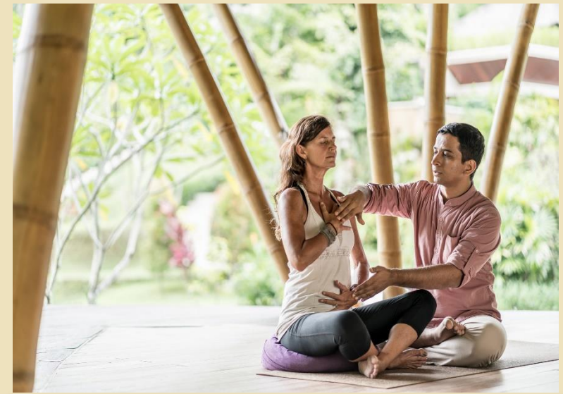
Yoga & Meditation