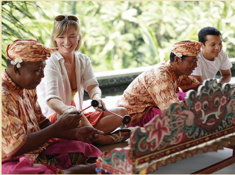
Dance & Traditional Music