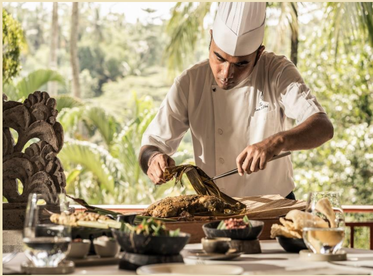
Chef Table at Sokasi