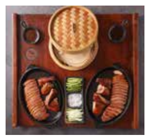
Souk Madinat Jumeirah - The Noodle House