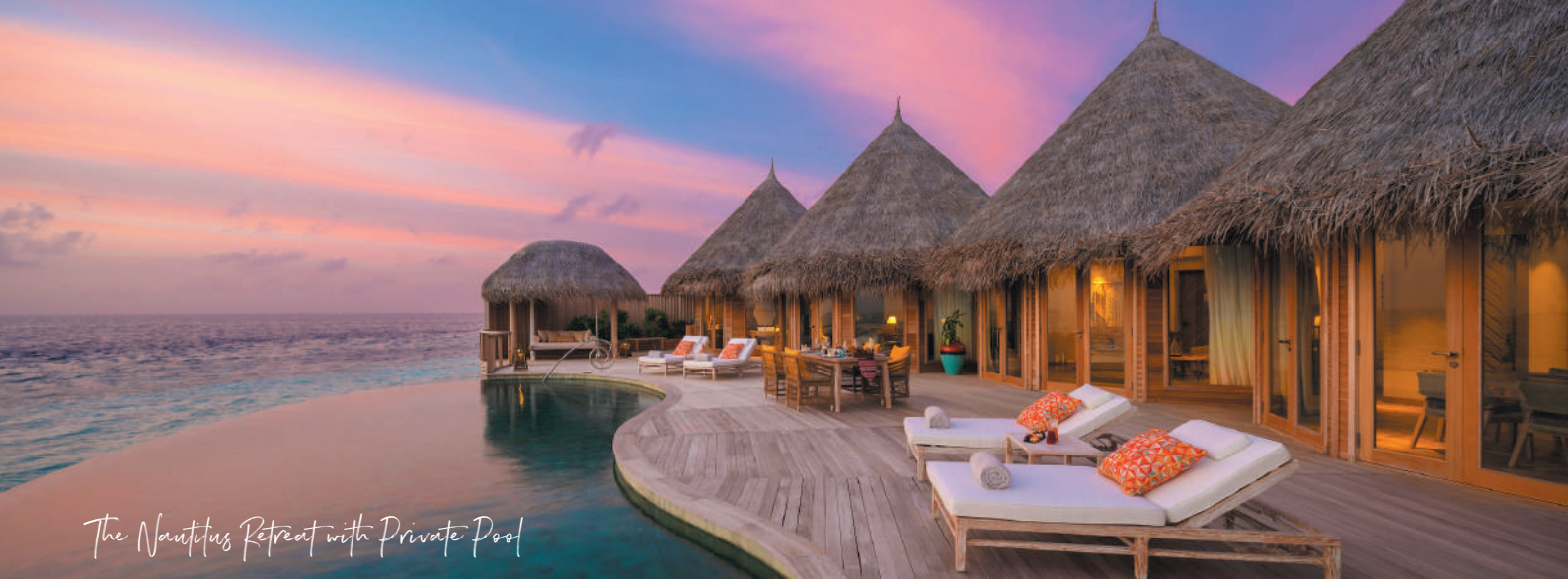
The Nautilus Retreat with Private Pool