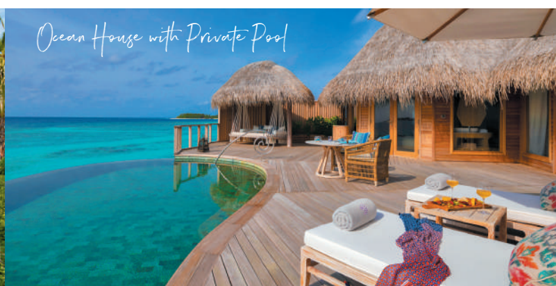
Ocean House with Private Pool