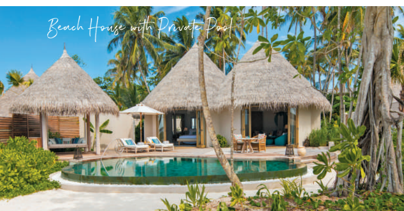
Beach House with Private Pool

The Nautilus Mansion was designed by the owner as his ultimate beach home. Available for once-in-a-lifetime stays, our three-bedroom castle-on-the-sand occupies a spectacular spot on the beach, with custom furnishings created from hand-selected materials. The residence's objets d'art and décor embody the island's pure bohemian spirit. Its sunlit, breeze-cooled spaces promise serenity and privacy – absolute freedom.