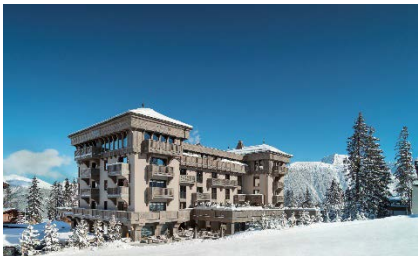
Destination & Arrival