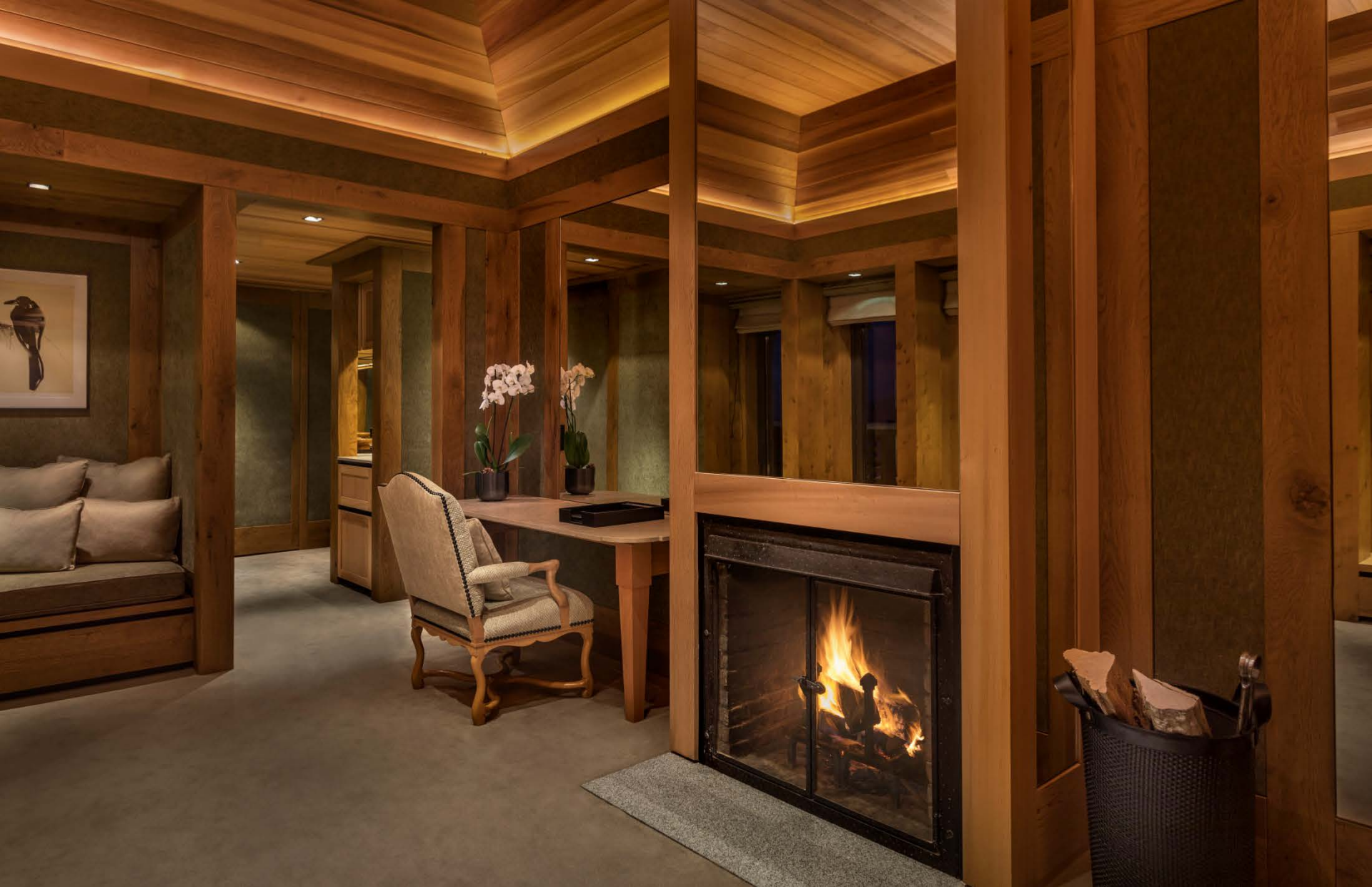
SUITE LE MELEZIN