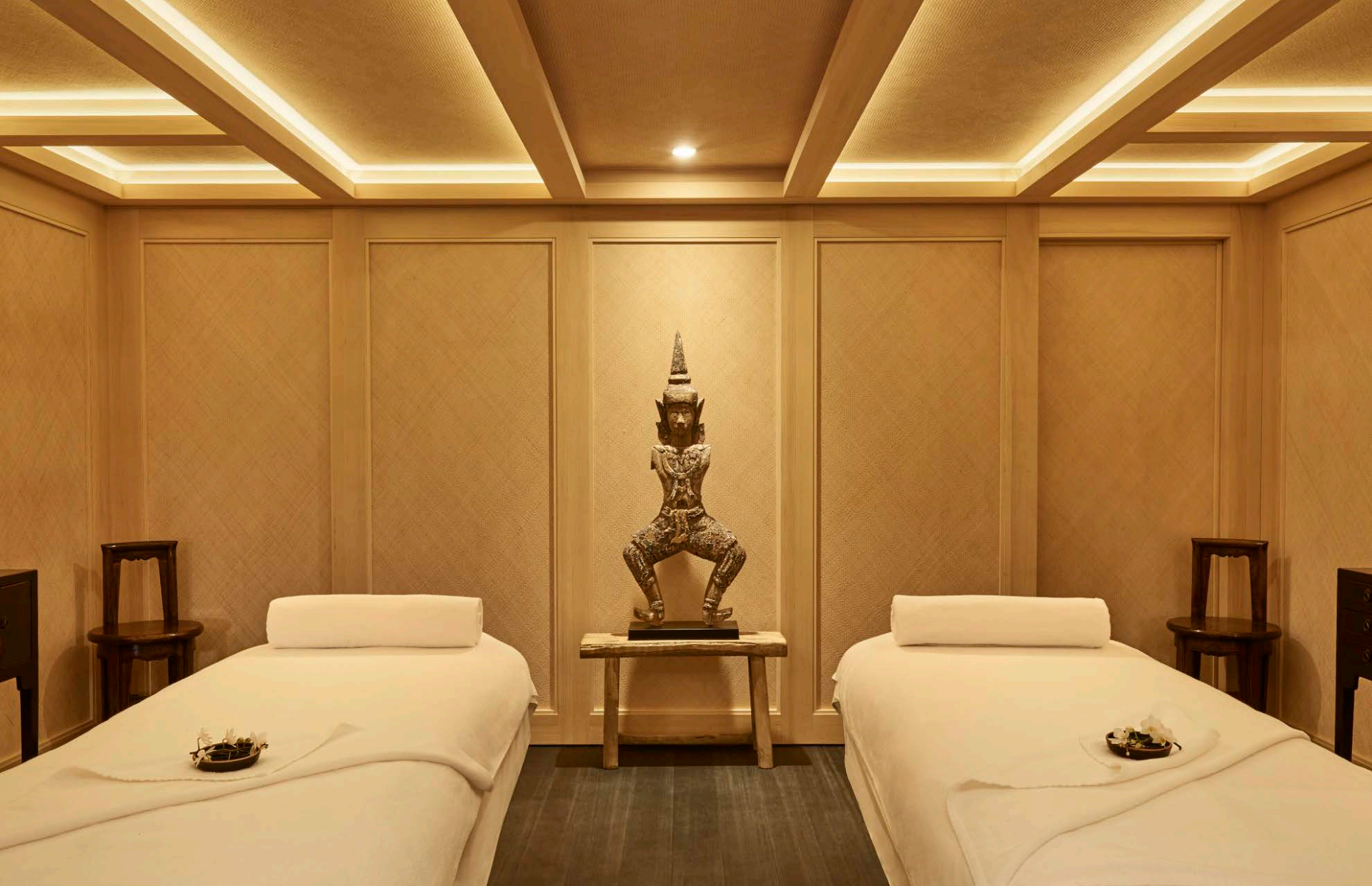
DOUBLE SPA SUITE