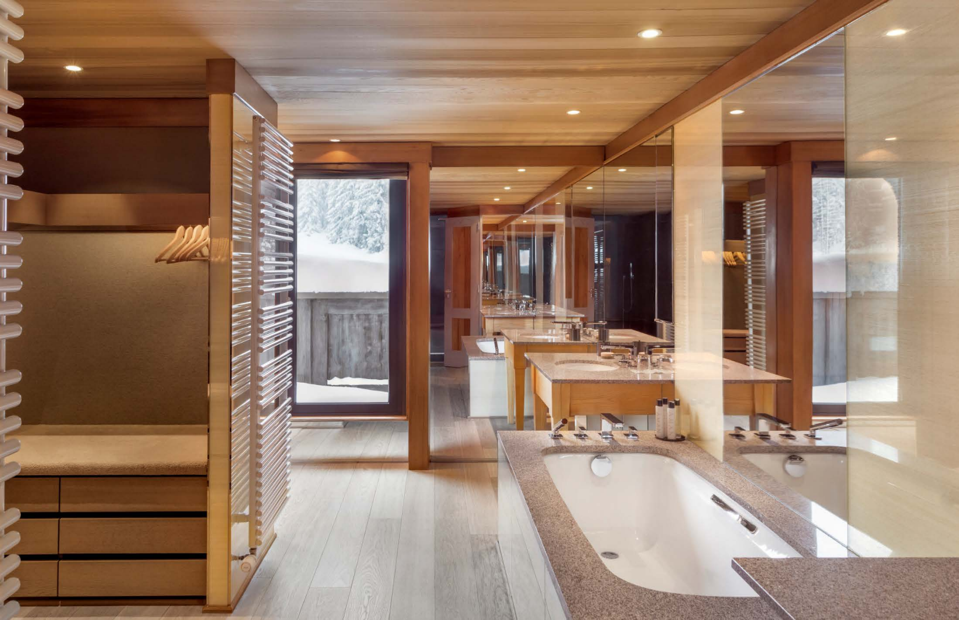
CHAMBRE SKI PISTE BATHROOM