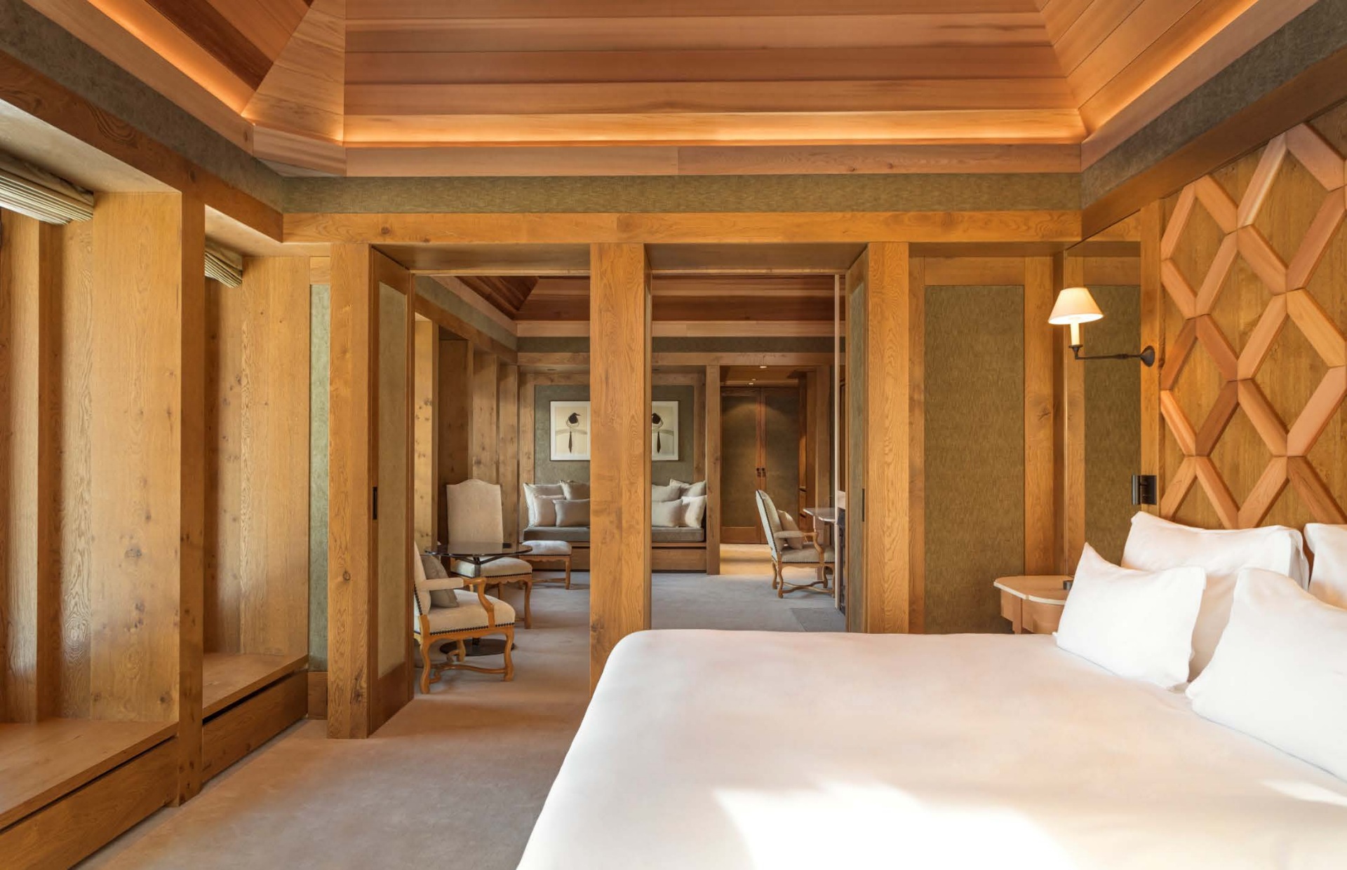
SUITE LE MELEZIN