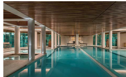
Spa & Fitness