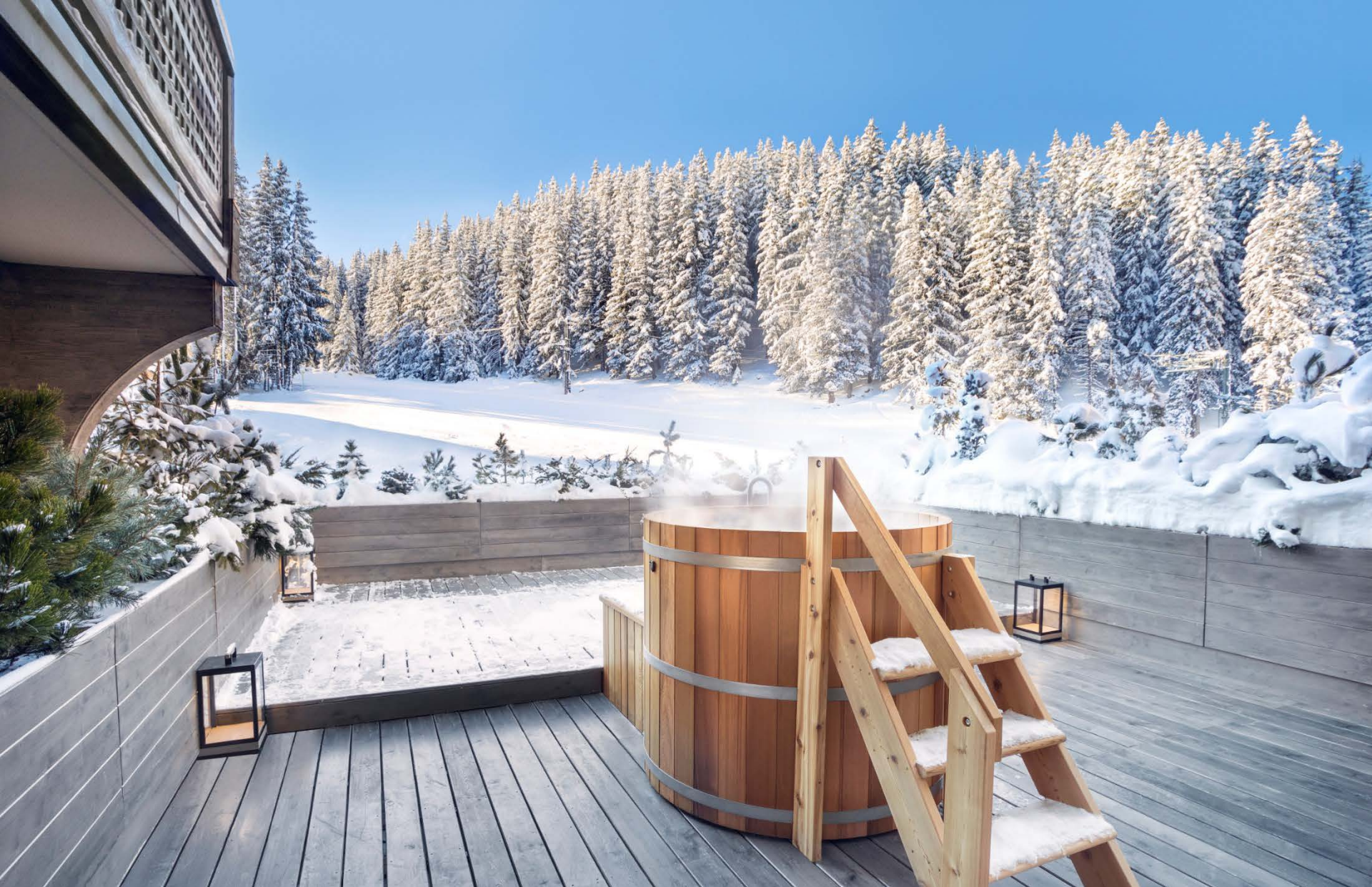
CHAMBRE SKI PISTE WITH HOT TUB