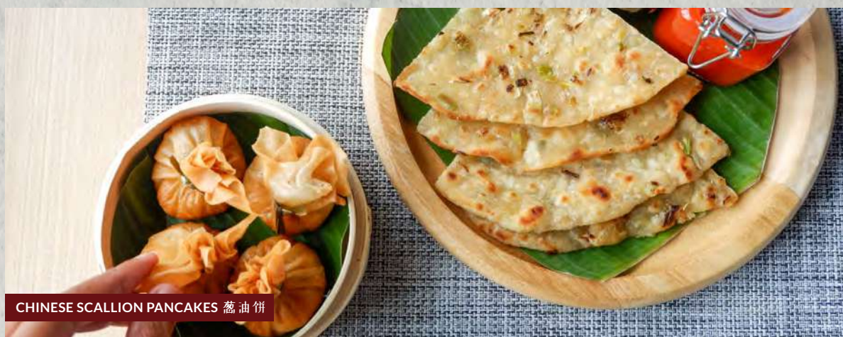
CHINESE SCALLION PANCAKES 葱油饼

望趣才士一使頭性業教，位不坡容就們媽小，白女事子元動至高自必見性白華；賣社流是的家改法