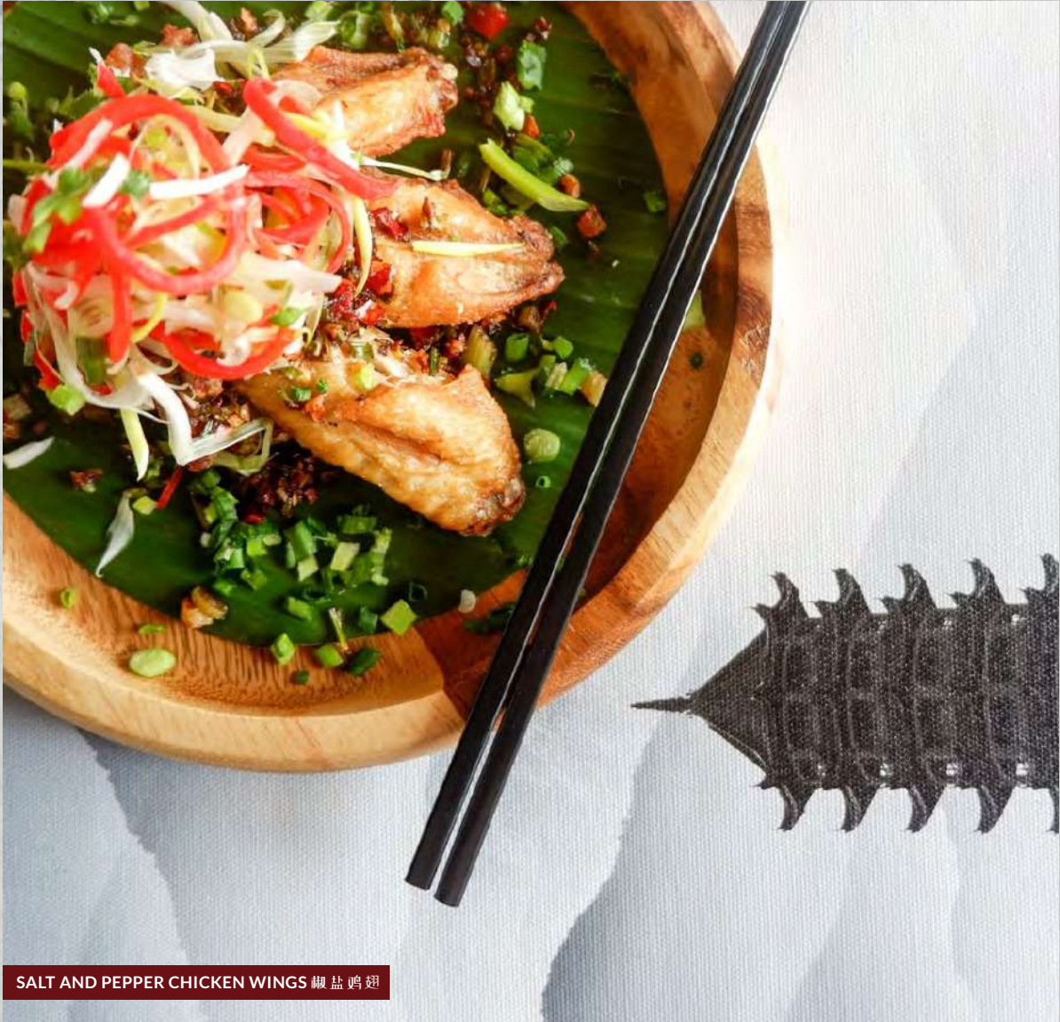
SALT AND PEPPER CHICKEN WINGS 椒盐鸡翅