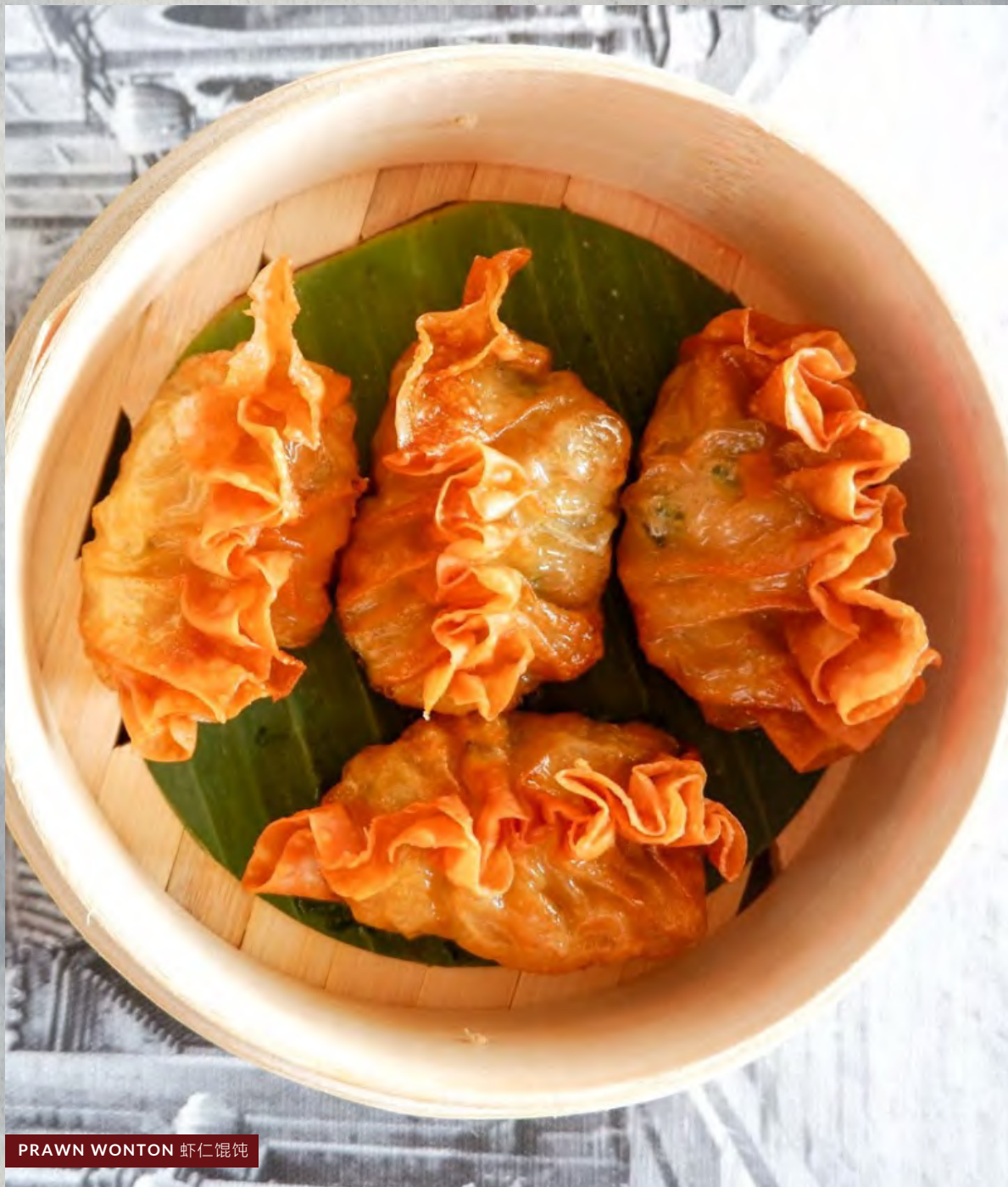
PRAWN WONTON 虾仁馄饨