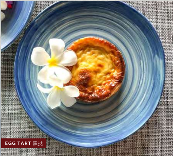
EGG TART 蛋挞