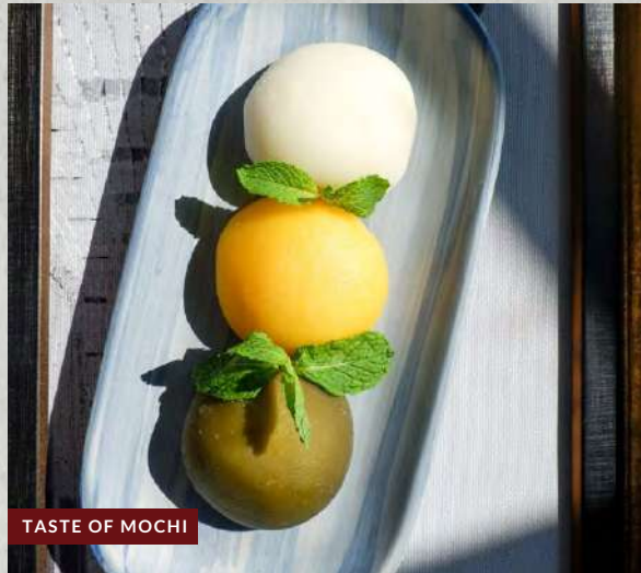
TASTE OF MOCHI