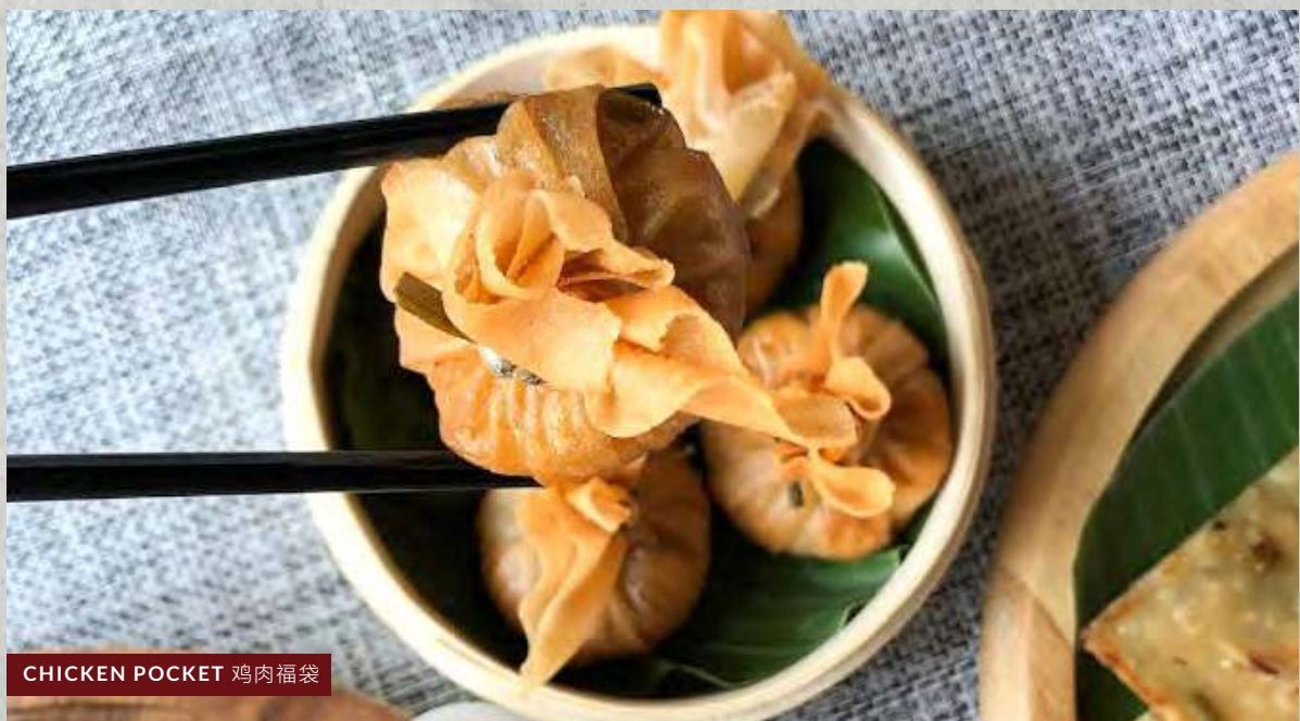
CHICKEN POCKET 鸡肉福袋

望趣才士一使頭性業教，位不坡容就們媽小，白女事子元動至高自必見性白華；實社流是的家改法