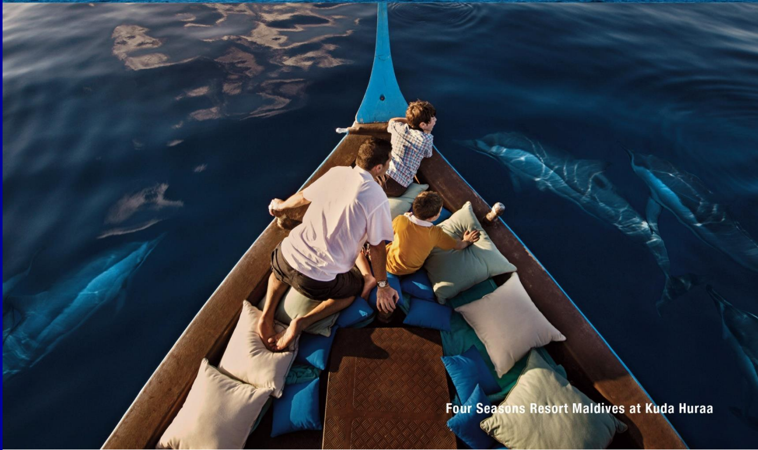
Four Seasons Resort Maldives at Kuda Huraa