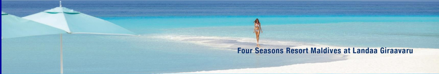
Four Seasons Resort Maldives at Landaa Giraavaru