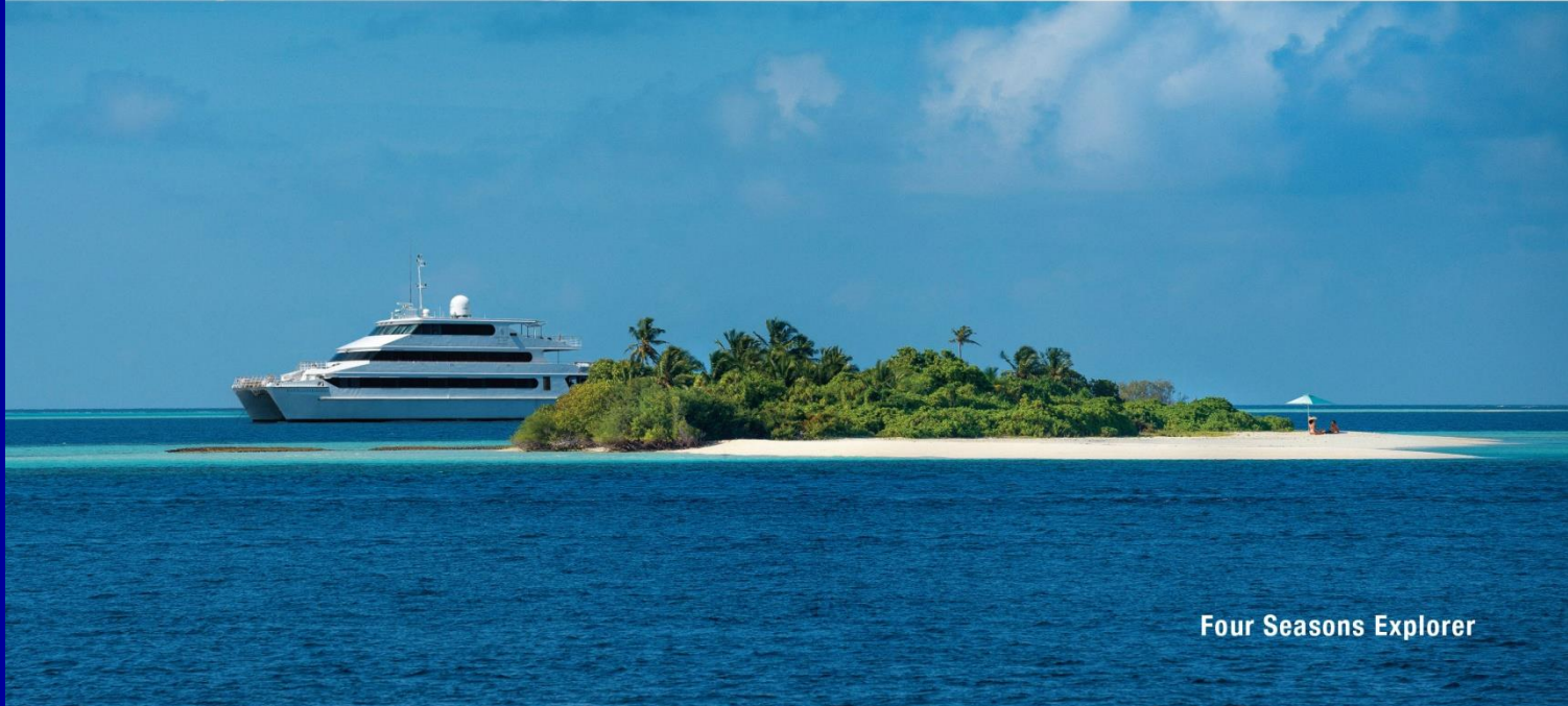
Four Seasons Explorer