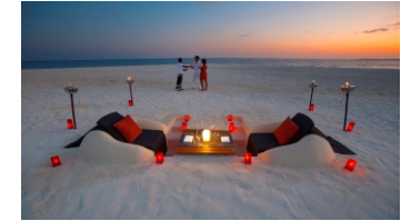
18:00 - 20:00 USD 550 (2 person)