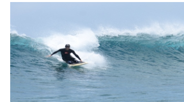
WAVE SURFING AT YIN YANG OR MADA'S

1 person 3 hrs USD 250 2 persons 3 hrs USD 300