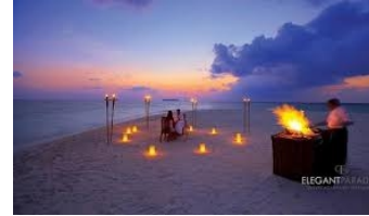
Private Sandbank Dinner (maximum 4 persons)

Another treat for two! This trip offers you the taste of a delicious barbecue dinner on our sandbank, the smell of a fresh breeze, the sound of waves and seabirds and the romantic atmosphere created by flickering candles underneath the tropical evening sky.