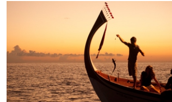
Group Handline Fishing Private Handline Fishing (maximum 6 persons)

We will provide everything from bait to lines, Experience the traditional way of fishing on a local boat with out-standing Maldivian hospitality.