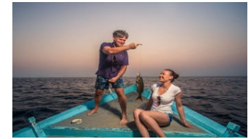
16:30 - 18:30 USD 65 2 hrs USD 250