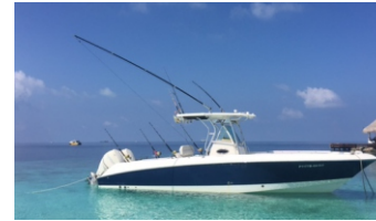
Fun Fishing Morning Fishing Afternoon Fishing

Enjoy Big Game Fishing on our branded fishing boat with all the modern equipment's and comforts. With our experienced crew each trip will be more fulfilling than the other.