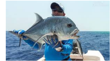
1 to 4(people) 2 hrs USD 400 1 to 4(people) 4 hrs USD 900 1 to 4(people) 4 hrs USD 800