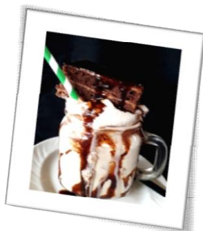
Black Shadow 160 Coffee, Chocolate ice cream, Whipped Cream, Chocolate cake, Caramel & Chocolate sauce