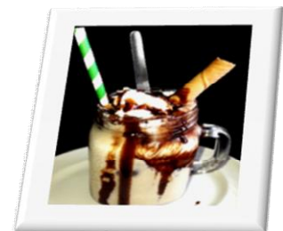
Vanilla Splash 100 Coffee, Vanilla Ice Cream, Wafer, Chocolate & Caramel Sauce